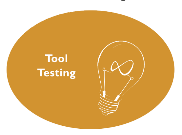
This is so cool.

There is a free AI tool that can restore your old torn and worn photos.